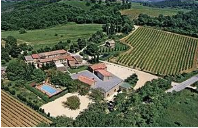
La Crociana vineyard