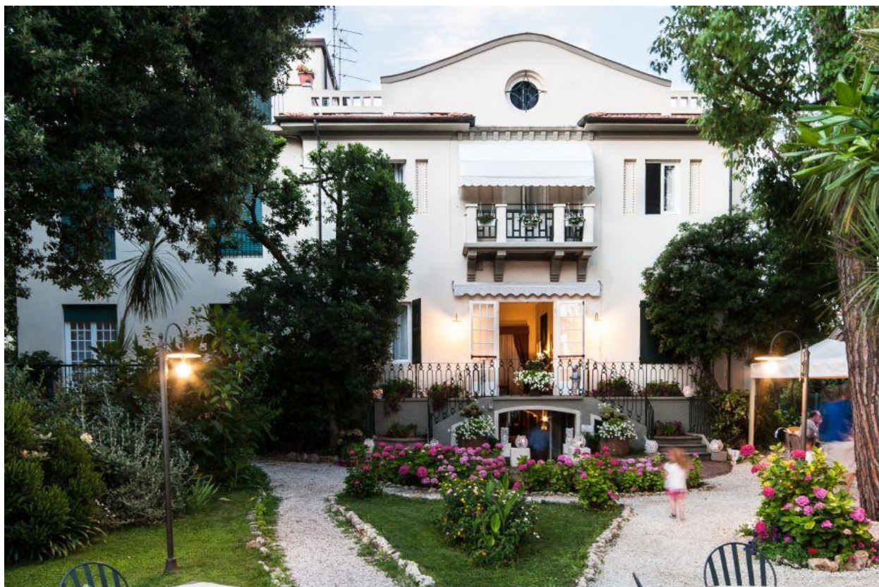
Hotel Club I Pini