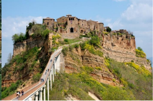
Civita di Bagnoregio